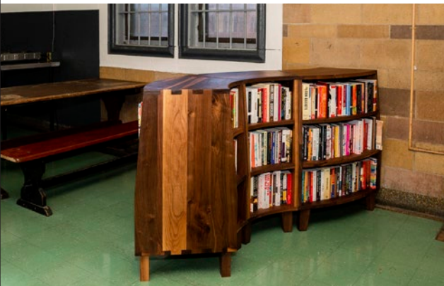
Freedom Library at Woodbourne Correctional Facility in Woodbourne, NY.

Freedom Reads' mission is to inspire and confront what prison does to the spirit. We bring beautiful, handcrafted bookcases into prisons, transforming cellblocks into Freedom Libraries. The Freedom Library is a physical intervention into the landscape of plastic and steel and loneliness that characterizes prison. In an environment where the freedom to think, to contribute to a community, and even to dream about what is possible is too often curtailed, Freedom Reads reminds those inside that they have not been forgotten.