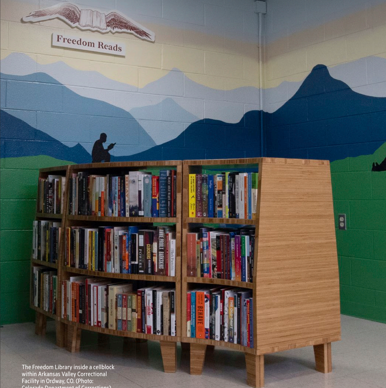
The Freedom Library inside a cellblock within Arkansas Valley Correctional Facility in Ordway, CO.

Freedom Libraries introduce the opportunity for informed serendipity, engagement, and the growth of communities of readers. Their curved, two-sided design showcases the 500-book collection—featuring such authors as Gabriel García Márquez, Dashiell Hammett, James Baldwin, Natalie Diaz, Miriam Toews, and John Edgar Wideman—and brings people, who might otherwise never speak, together over books. The library's beautiful curving shelves suggest a universe that ultimately bends towards justice.