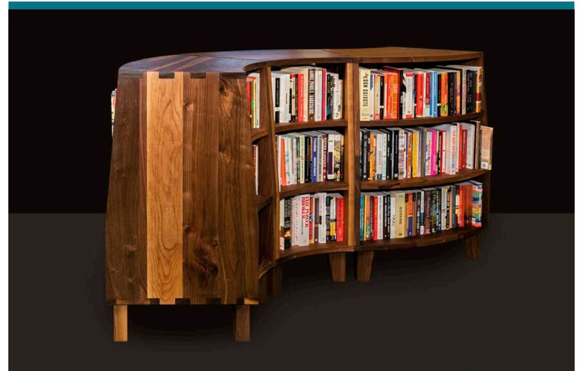
A three-shelf Freedom Library in American Black Walnut reflecting the curved design filled with the 500-book collection.

Every element of the Freedom Library's design serves as a physical intervention into the chaos of prison, introducing a beautiful and regenerative addition to the space. To bring nature into the lives of men who have not seen a tree in years or decades, the bookcases are carved from solid wood: maple, cherry, walnut, or oak. Instead of leaning against a wall, the Freedom Library curves and is positioned in the middle of an open space because, as Alberto Manguel argues in The Library at Night , "a circular library more generously allows the reader to imagine that every last page is also the first."