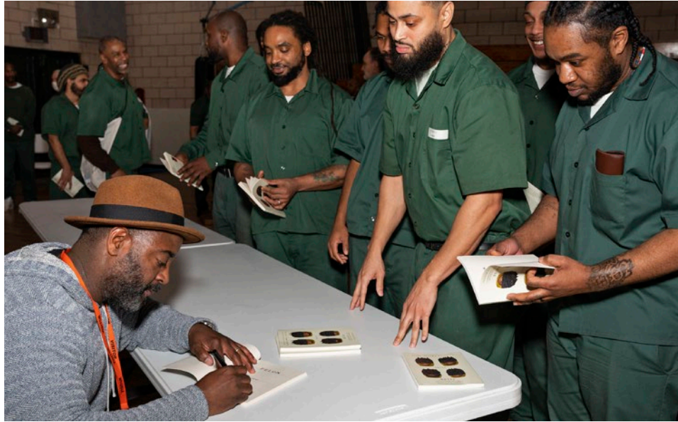
Freedom Reads Founder & CEO Reginald Dwayne Betts signing copies of his book for audience members following a performance of FELON: An American Washi Tale inside Woodbourne Correctional Facility in Woodbourne, NY.