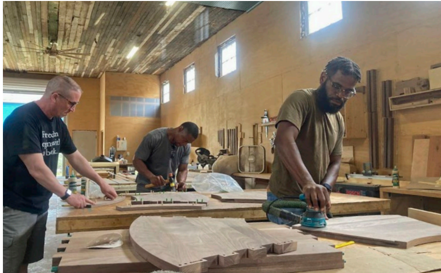
Freedom Library inside a cellblock at Elayn Hunt Correctional Facility in St. Gabriel, LA.