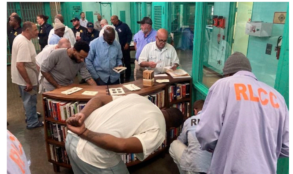
Men at Raymond Laborde Correctional Center in Cottonport, LA, taking their first glimpse of the Freedom Library.

By opening a Freedom Library for prison staff, Freedom Reads acknowledges the crucial role that they play in transforming the experience of incarceration. We recognize that the absence of beauty, the absence of nature, and the absence of the transformative power of a book frustrates their experience of prison as well. The Freedom Library is an intervention that changes the experience of everyone who enters a prison. The libraries include a range of materials designed to comfort and challenge, to meet readers where they are and where they're going. Freedom Libraries turn cellblocks into communities.