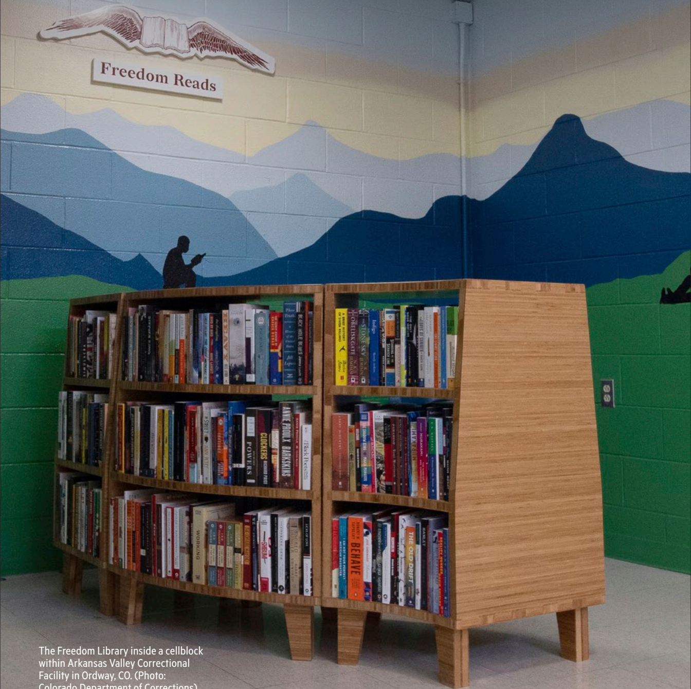
The Freedom Library inside a cellblock within Arkansas Valley Correctional Facility in Ordway, CO.

Freedom Libraries introduce the opportunity for informed serendipity, engagement, and the growth of communities of readers. Their curved, two-sided design showcases the 500-book collection—featuring such authors as Gabriel García Márquez, Dashiell Hammett, James Baldwin, Natalie Diaz, Miriam Toews, and John Edgar Wideman—and brings people, who might otherwise never speak, together over books. The library's beautiful curving shelves suggest a universe that ultimately bends towards justice.