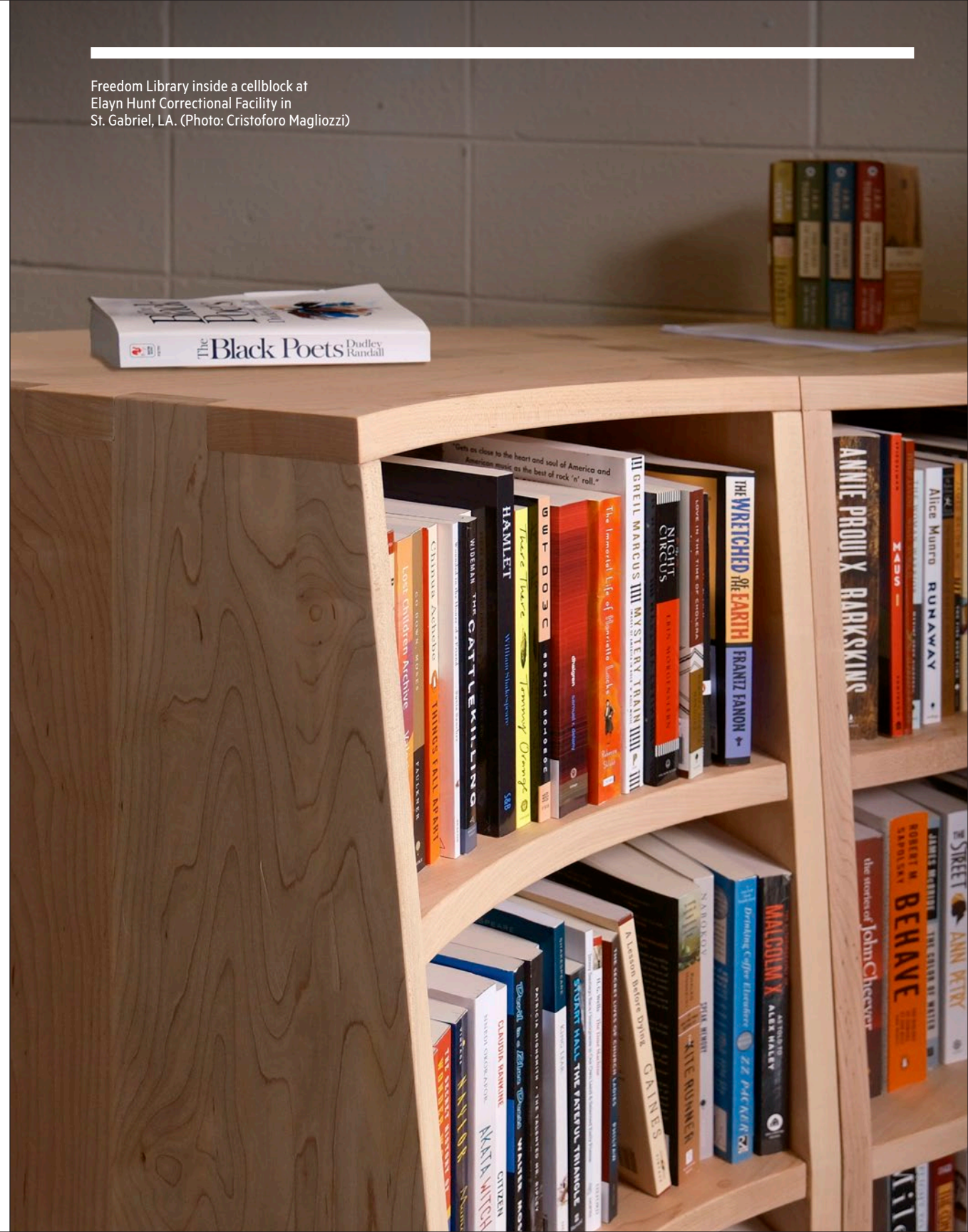
Freedom Library inside a cellblock at Elayn Hunt Correctional Facility in St. Gabriel, LA.